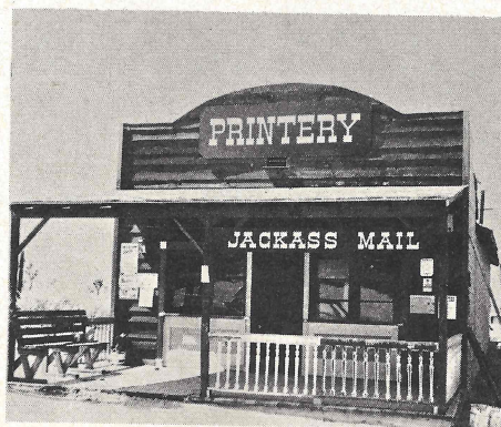
Pioneertown mail is delivered daily by jackass.

There's a Golden Stallion restaurant and bar, a corral well stocked with horses, a United States Post Office (officially