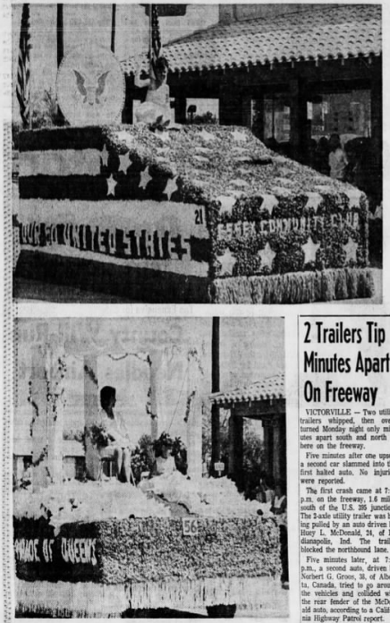
BANK ENTRY—'Parade of Queens' was filled with America's finest in the Colorado River Marathon Parade.