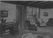
BEAMED CEILINGS and plus wall-to-wall carpeting lead into of luxury in Happy Home living rooms, above.

Monthly payment at Happy Homes is only $189 with monthly payments of $100, principal and interest and full price of $9495, Birkus said. Happy Homes furnished models are reached via San Bernardino Freeway to Park Road north (right), go to Valley Blvd., right on Valley to