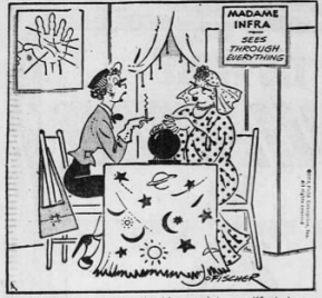
"This handsome man who should come in my life today... could you make that tomorrow instead? I'll have a new permanent then."