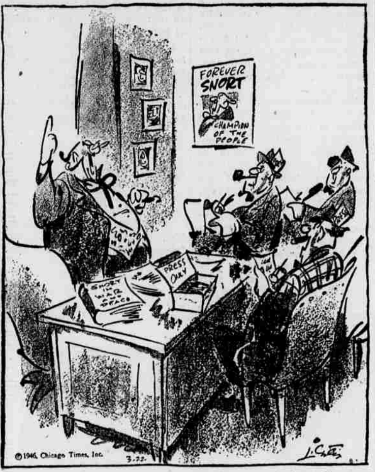
—And congress can't hope to hold the respect of people on our present salaries! Why, people are calling us CHEAP politicians!—